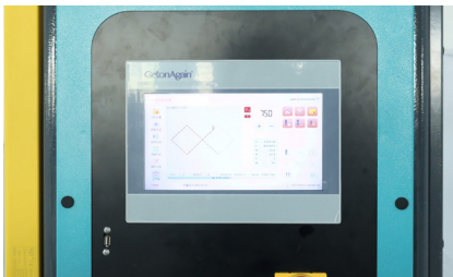
触摸屏人机交互界面 Touching Screen Human-Machine Interface