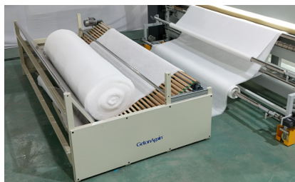
【选配】自动送棉装置 [Optional] Automatic Fiber Feeding Device