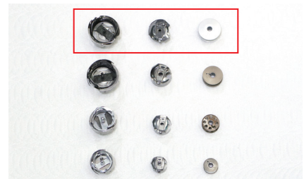
4倍旋梭/梭壳/梭芯 4x Large size Rotary Hook/Bobbin Set