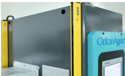
【选配】安全光幕 [Optional] Safety Light Curtain