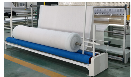
【选配】自动卷料装置 [Optional] Automatic Roll-up Device